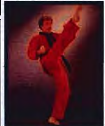
Chuck Norris doing high kicks.

Bruce Lee, before his death was very tough in karate. Chuck Norris uses a different style than Bruce Lee. Bruce Lee uses Chinese gung fu fighting and tae kwon do. Chuck Norris uses tae kwon do, tae soo do and kickboxing. He was the middle weight champion for kickboxing in 1967.